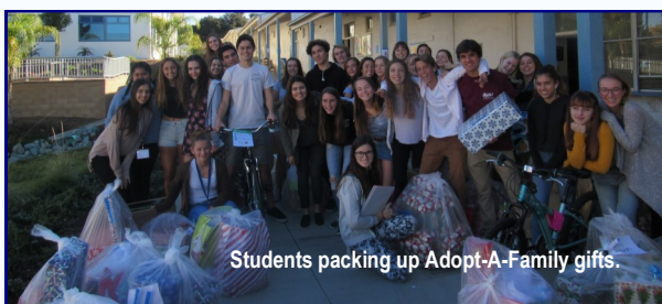
Students packing up Adopt-A-Family gifts.

For more information regarding activities and events at SDA, please visit the SDA website under "ASB." Also, follow us on Instagram "SDAStudentLife."